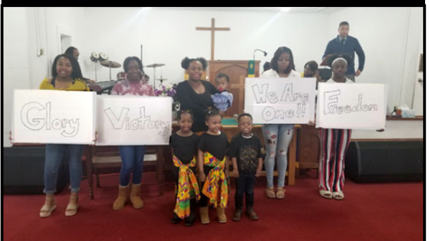
On February 23rd the youth of Oxford First put on a praise dance presentation of The Storm is Over Now led by the little ones performing Freedom for Black History Month.