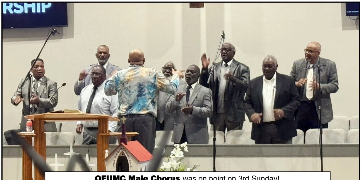
OFUMC Male Chorus was on point on 3rd Sunday!