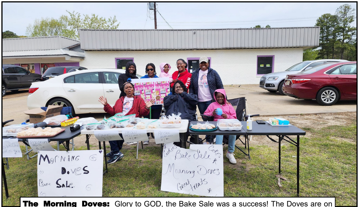
The Morning Doves: Glory to GOD, the Bake Sale was a success! The Doves are on their way to The Passion of CHRIST in Arkansas. To ALL who gave donations, participated in any shape form or fashion, THANKX from the Morning Doves.